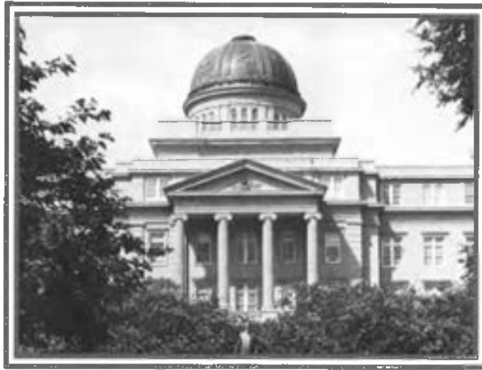
Texas A&M University's Academic Building.

Texas A&M University, the Lone Star State's first public institution of higher learning, is one of the select few universities in the nation to boast triple land-grant, sea-grant, and space-grant status.