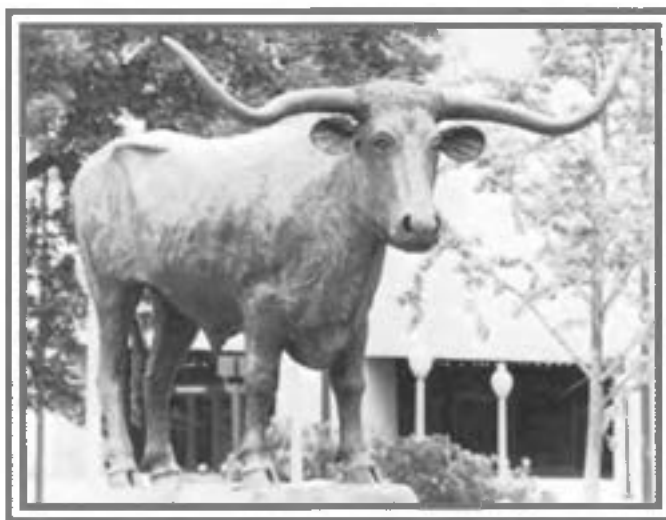
The university mascot, "Bevo" the longhorn, graces the courtyard of John Hargis Hall on the UT campus.

Now in its 117th year, the University of Texas at Austin is recognized among major universities for its eminence in research, teaching, and public service. It is the oldest and largest component of the 15-campus University of Texas system. Since its opening in 1883, the University has grown from a 40-acre tract to a main campus of more than 410 acres and 119 buildings.