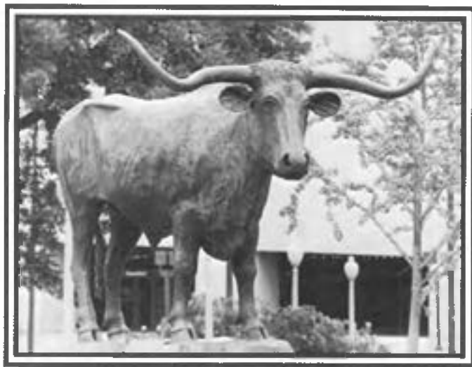
The university mascot, "Bevo" the longhorn, graces the courtyard of John Hargis Hall on the UT campus.

Now in its 114th year, the University of Texas at Austin is recognized among major universities for its eminence in research, teaching, and public service. It is the oldest and largest component of the 15-campus University of Texas system. Since its opening in 1883, the University has grown from a 40-acre tract to a main campus of 357 acres and 119 buildings.