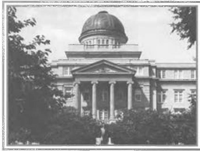
Texas A&M University's Academic Building.

Texas A&M University, the Lone Star State's first public institution of higher learning, is one of the select few universities in the nation to boast triple land-grant, sea-grant, and space-grant status.