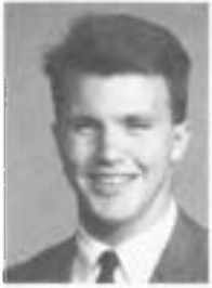
Derek N. Thompson Memorial H.S. (Houston, Tx) Major: BioMedical Science Honors: Dean's List, Golden Key National Honor Society Activities: Baptist Student Union (Executive Council), Intramural Football (All-Residence Hall Champs), Puryear Hall (Resident Advisor).