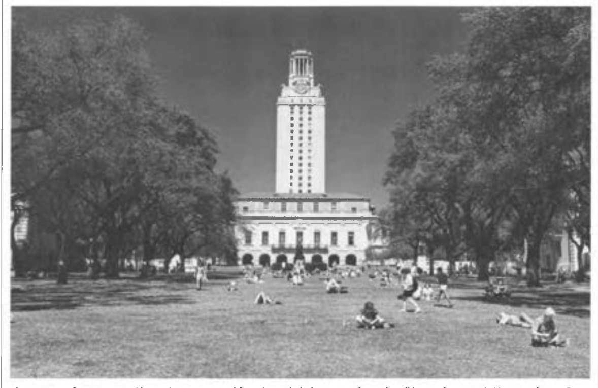
The University of Texos Main Building and Tower as viewed from the south, looking across the south mall lawn.

The University campus also extends way beyond the boundaries of the main campus, incorporating research centers across the state that keep the University at the forefront of study in such areas as geophysics, astronomy, marine science, history, literature, and engineering.