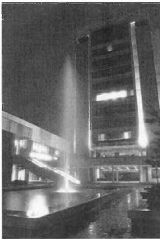
J. Earl Rudder Tower and Theater Complex, a part of the University Center complex at Texas A&M University.

Not to be limited by state or national boundaries, Texas A&M is firmly committed to being a vital part of the "global village." Its international outreach efforts include memoranda of understanding with more than 50 foreign institutions and organizations in Europe, Asia, and South and Central America. In the spring of 1990, Texas A&M opened a branch campus in Koriyama, Japan. The new campus was initiated and funded by that Japanese city in hopes of providing American educational opportunities to Japanese students. In addition, Texas A&M operates the Santa Chiara Study Center in Castiglione Fiorentino, Italy, and many College Station-based multidisciplinary groups are devoted to enhancing research and scholarship opportunities both at home and abroad. □