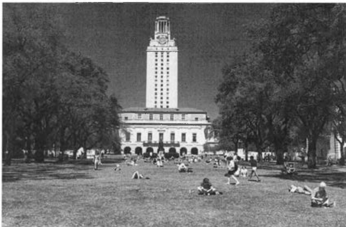
The University of Texas Main Building and Tower as viewed from the south, looking across the south mall lawn.

The University campus also extends way beyond the boundaries of the main campus, incorporating research centers across the state that keep the University at the forefront of study in such areas as geophysics, astronomy, marine science, history, literature, and engineering. □