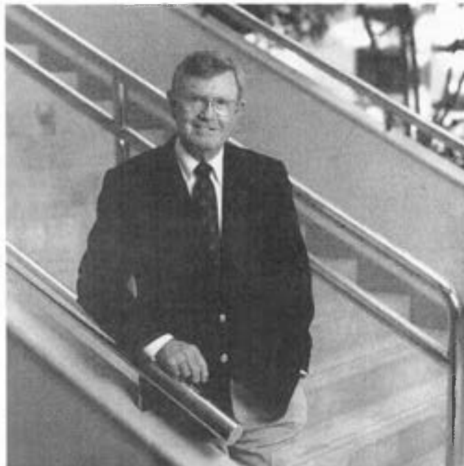
Darrell K. Royal